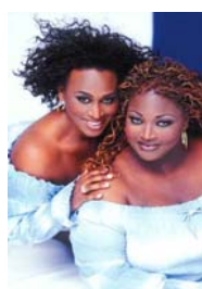
The Weather Girls