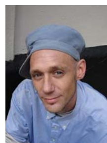
Curiosity Killed the Cat